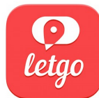
Photo sharing social media application. Users can enhance their photos and upload them to share on Instagram. #Weed4sale is utilized on this service.